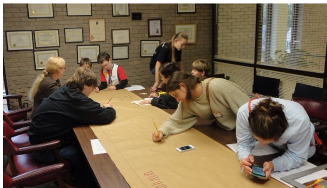
Rockheads hard at work.

When we had gone to the tile section; we found: marble, granite and slate. Marble is a metamorphic rock. Slate is a sedimentary rock. Granite is an igneous rock.